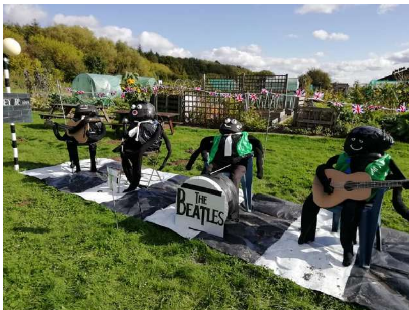
JUST A FEW OF THE SCARECROW ENTRIES !!