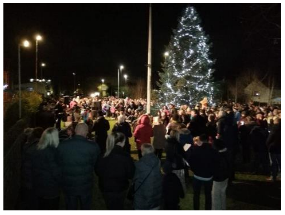
A record breaking Carols on the Green event , Christmas Eve 2019 more on Page 9

Parish Council meeting: Thursday 13th February, 7pm @ Village Hall Parish Council meeting: Thursday 12th March, 7pm @ Village Hall