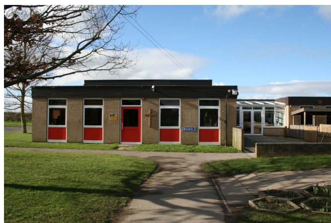
The New School