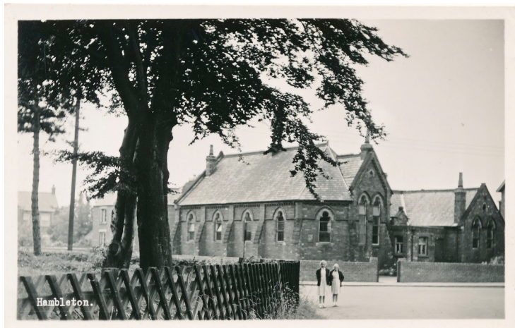
The Old School