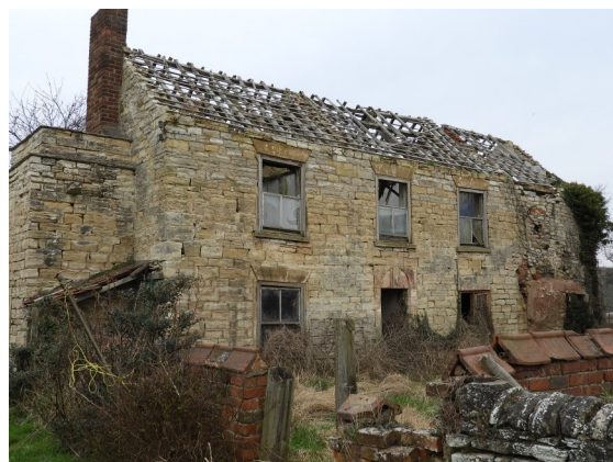
Owlet Hall, often called Howlet Hall in old documents