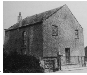
The Old Chapel

On 8th September, 1899 the Selby Times reported that a new Chapel was to be built in Hambleton. The land, south of the School Room, was purchased for the New Chapel. The foundation stone was laid on 7th September, 1899 and the opening ceremony held on 13th July, 1990. The cost of the new Chapel was in the region of £1,350. More information can be found on our village history website hhraa.org