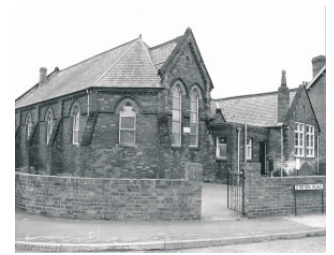
The Old School which acted as a Church between 1872 and 1882