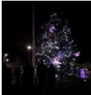
Above: Hambleton Christmas Tree illuminated at the 1st Hambleton Lights