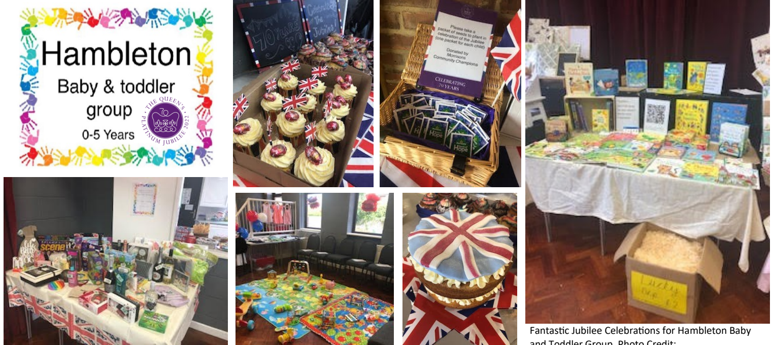
Fantastic Jubilee Celebrations for Hambleton Baby and Toddler Group.

A BIG thank you to everyone who supported The Hambleton Baby & Toddler Group's Jubilee celebration and fundraising event held in the village hall on the 1st June. It was a great morning with a magician, toys, a cake decorating competition, a bake sale, Jubilee crafts and lot of stalls. As an extra special treat for the occasion we also had a donation of strawberries and ice cream for the children's snack time! The event raised an amazing £376 for the group which couldn't have been done without donations of prizes, cakes and of course the attendance of those who came along. The money raised will make a huge difference to the groups fund for potential resources.