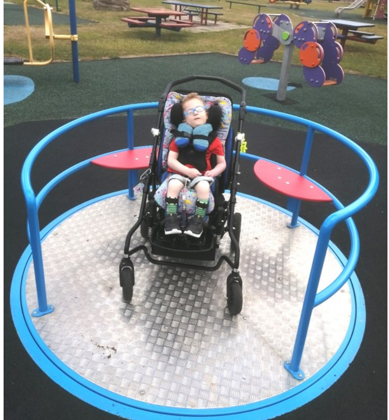
NEW INCLUSIVE ROUNDABOUT - see page 3

Next Parish Council meeting will be on 11th August, 7pm at the Village Hall