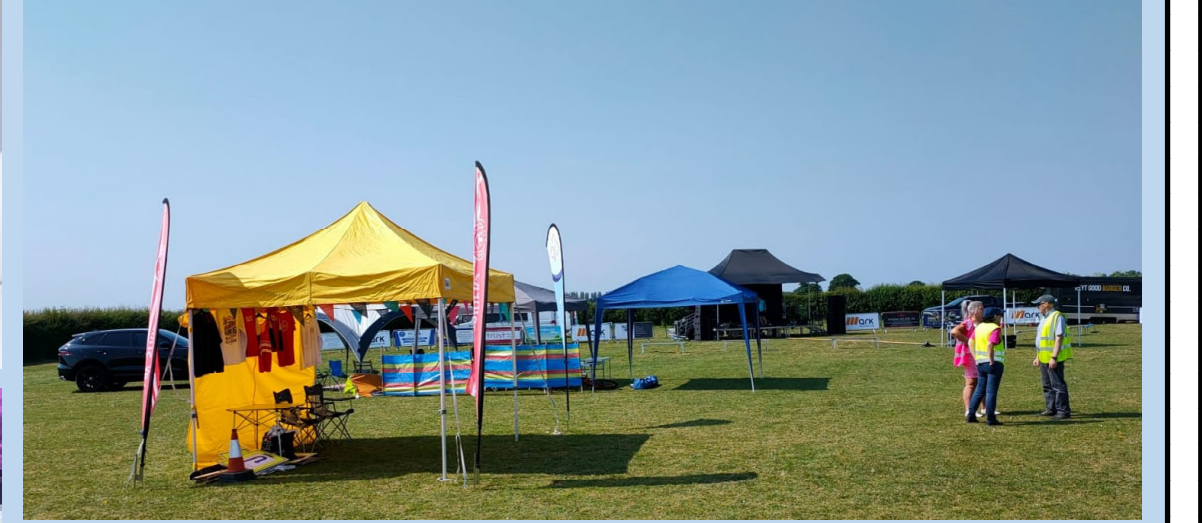
all team then make light work of building their big marquee, and our